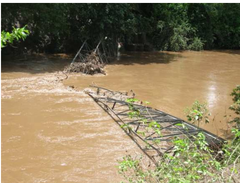
The Kuron Pedestrian Bridge in the water

On the morning of the 29 th of May, very sad news came to the compound of the Holy Trinity Peace Village: The Pedestrian Bridge, connecting the Peace Village with the Youth Centre on the other side of the Kuron River, had been taken down by the river. Overnight heavy rains in the mountains led to a fast increase of the water level up to the edges of the riverbed. Apparently, the swollen river carrying a huge uprooted tree, had forced down the iron- welded bridge from its foundation.