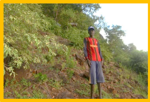
Figure 1 Toposa have traditionally produced honey

Eat honey, my son, for it is good; honey from the comb is sweet to your taste.” Proverbs 24: 13