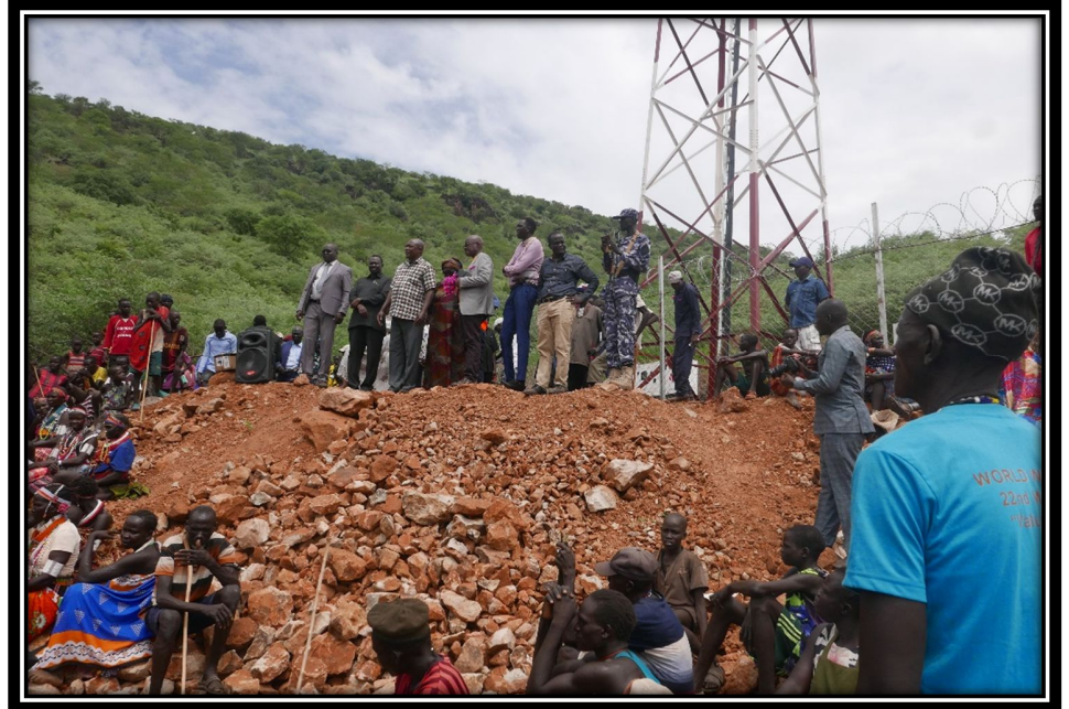
Governor and Ministers address the Toposa at MTN Tower Inauguration

The phones are also useful as contact with Kapoeta can be made very quickly to arrange for animal medicines to be transported out to these remote areas. Before it would take a week walking one way in order to carry messages to Kapoeta. If someone from the villages has to go to Kapoeta for health care it is now much easier for those family to keep in touch and provide up to date reports on the status of the patient. Before no one knew anything for weeks.