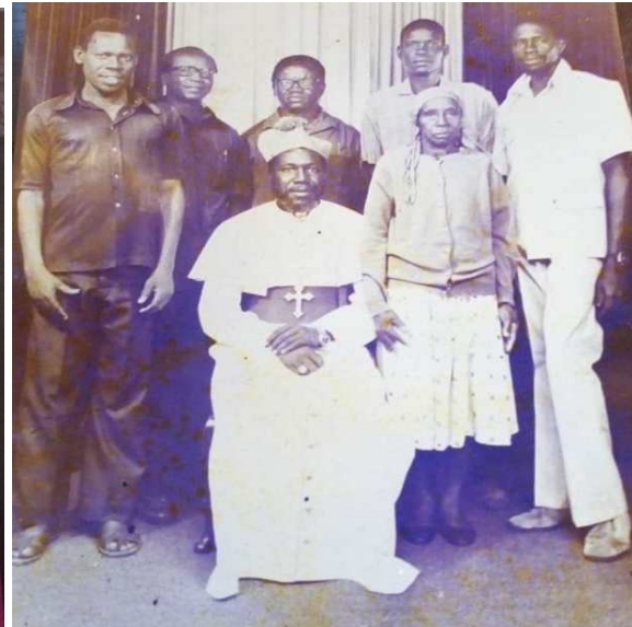
The team who attended the Ordination in Kinshasa

I was ordained a priest on 24 th May 1964 and ordained Auxiliary Bishop of Juba Archdiocese on 4 th May 1980 and was appointed the Bishop Ordinary of Torit Diocese on 7 th August 1983.