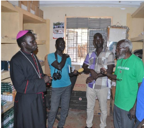
Update on the situation at Matara health care unit