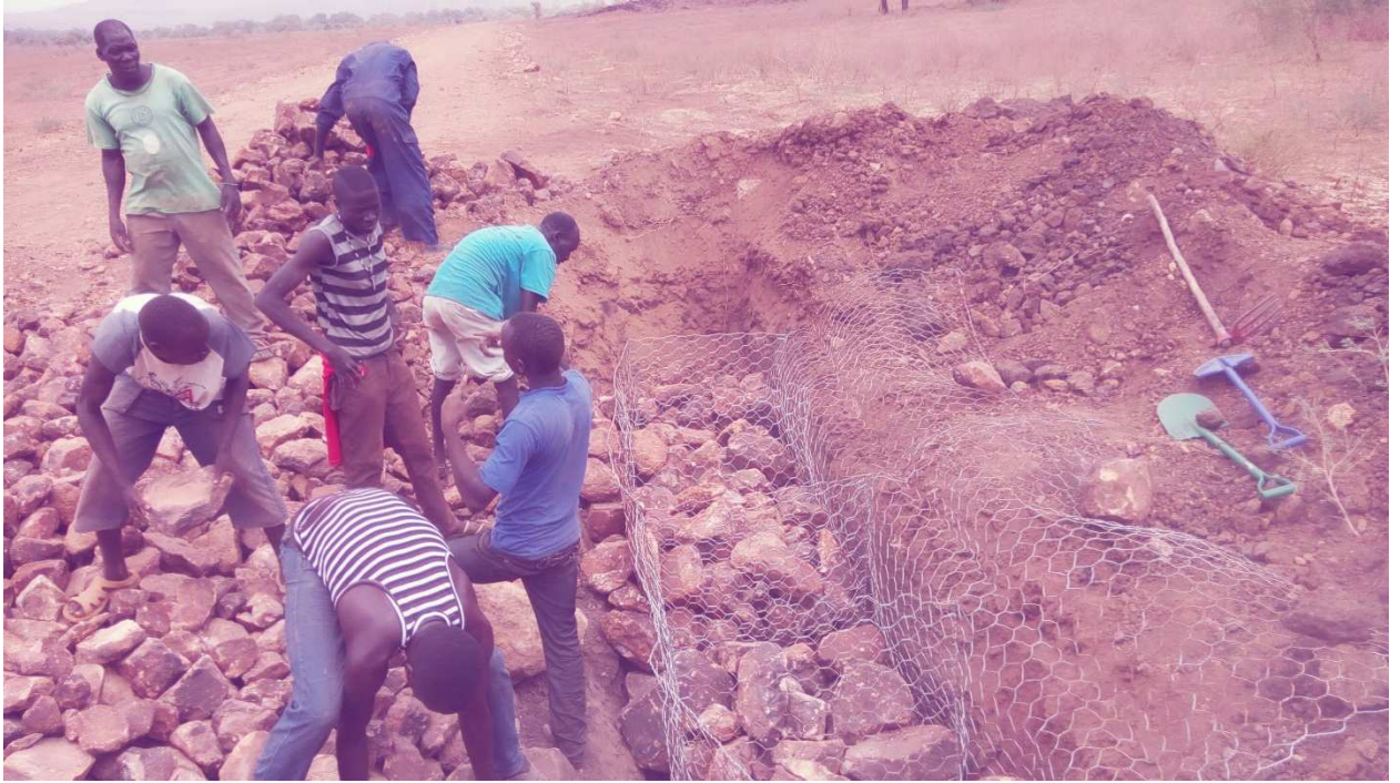
After JCB excavation, gabions are installed by youth