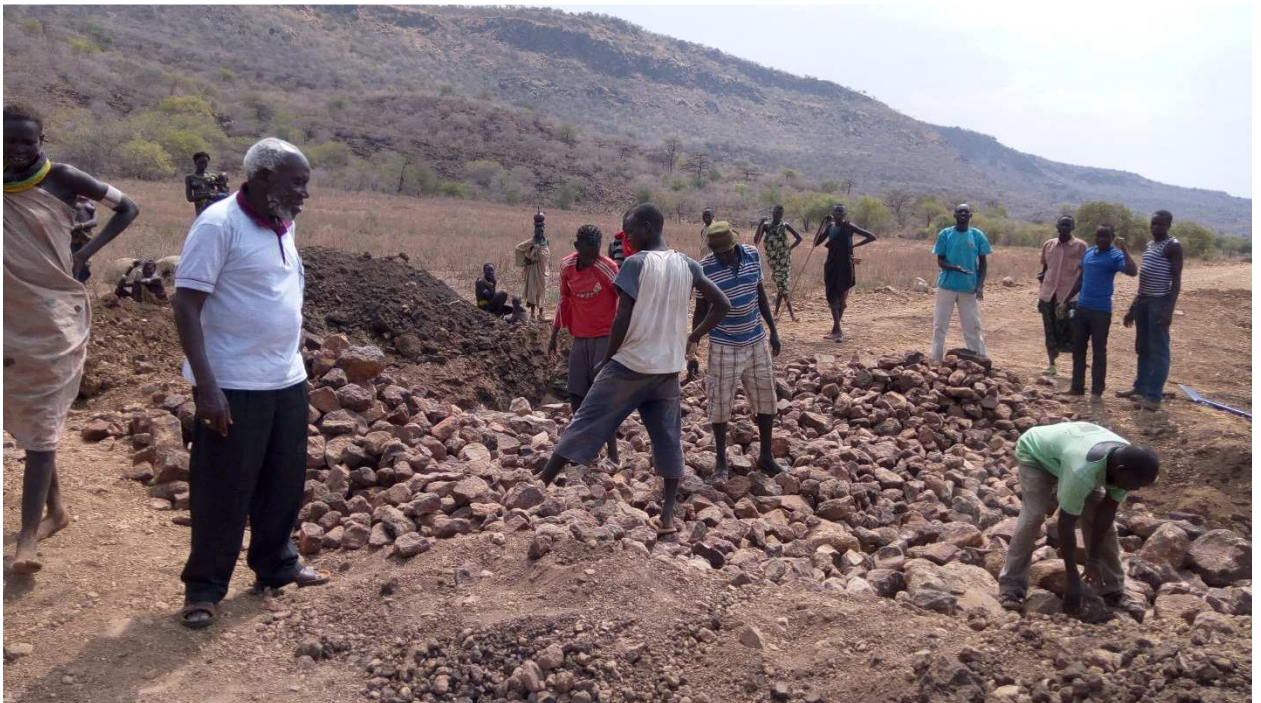
HTPV Founder, Bishop Paride Taban inspects progress of the road works at Kakuta village.