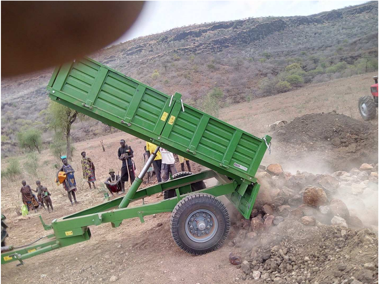
Hydraulic offloading by the new tractor (John Deere) at Kakuta village.