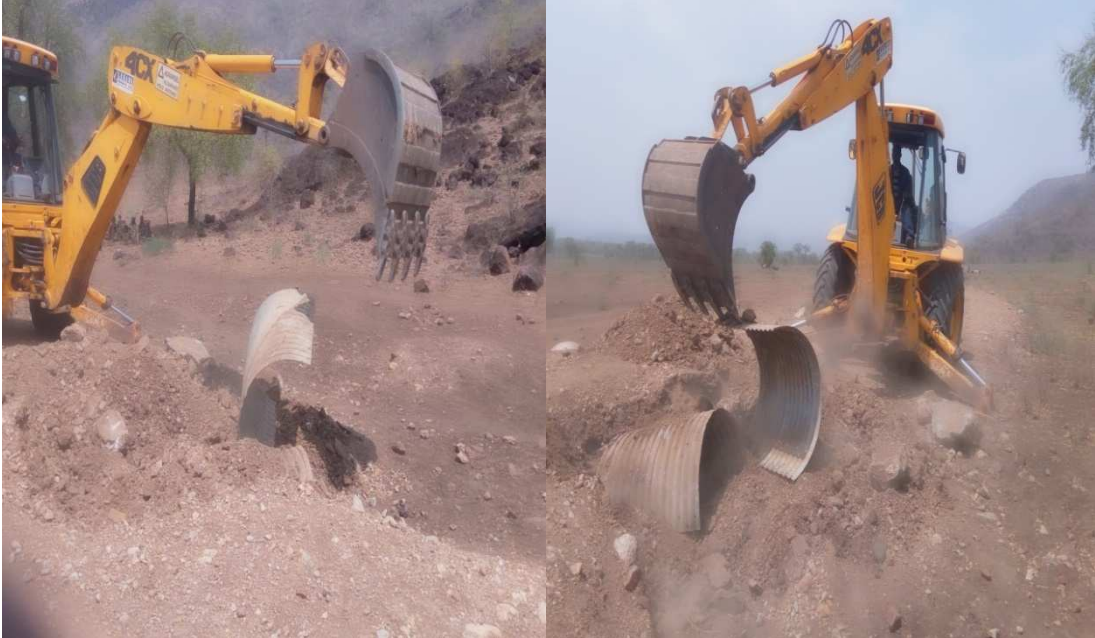
Removing old culverts at Kakuta and Naruchomin villages