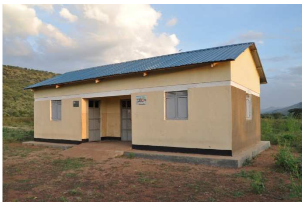
The building for Gender Based Violence Program

There is constructed a pit-latrine with two units, and two bathrooms next to the office building for Gender based Violence Program. This pit seems not in use