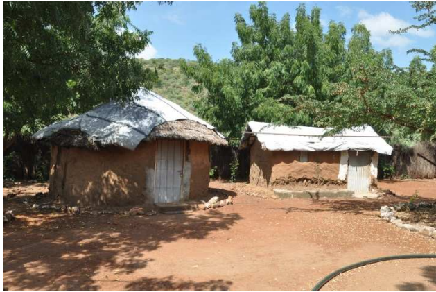
Two of the staff houses that needs replacement

The staff houses which are locally made are in a poor condition. New staff houses are badly needed. A proposal for a donation is prepared by Joseph. The cost is estimated to 30 000 USD for 4 units. This proposal should be monitored and then forwarded to potential donors.