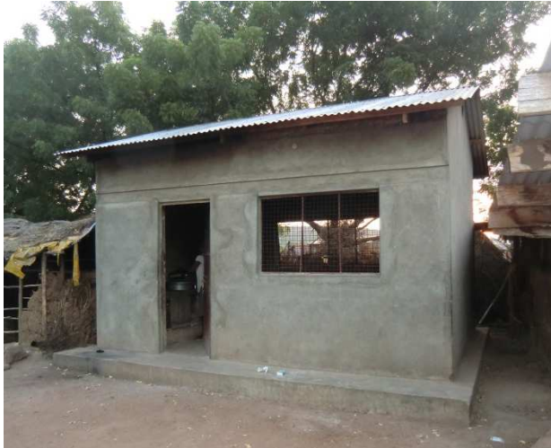
The new kitchen building

A new kitchen is constructed in the compound. Good quality, financed by Join Good Forces.