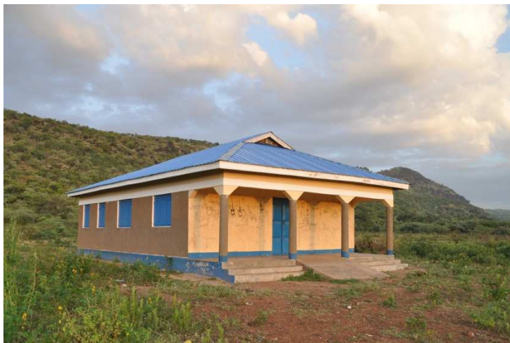
The new, unused Maternity Ward

A new building is made to host a Maternity Ward. This is not equipped, nor taken into use. This building is located outside the Clinic Compound.